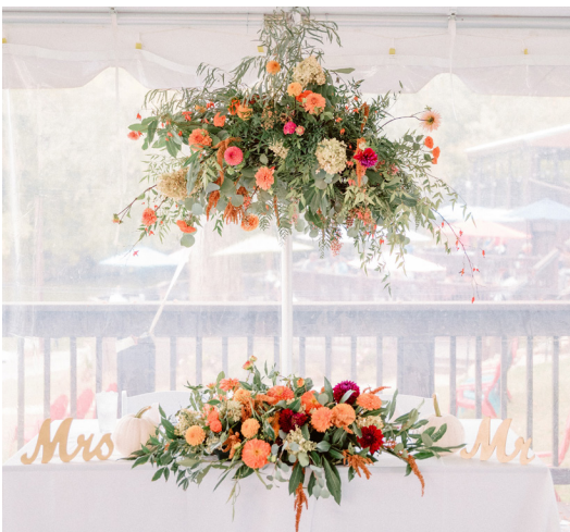
Photo Includes Large Statement Piece Hanging, Medium Piece on Table