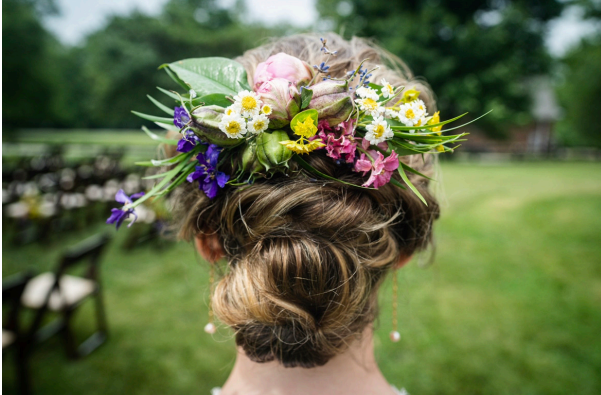
Small Flower Crown