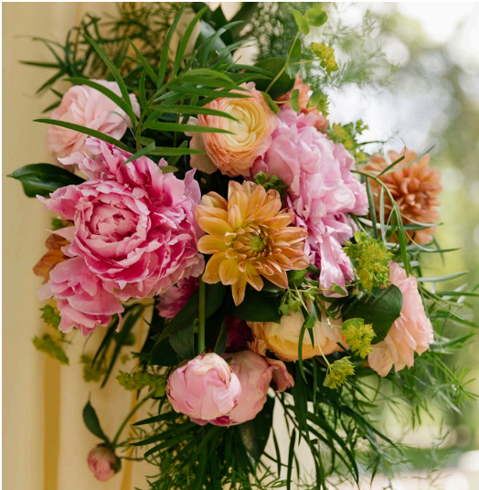
Altar Hang Round