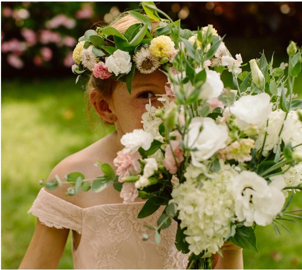
Full Flower Crown