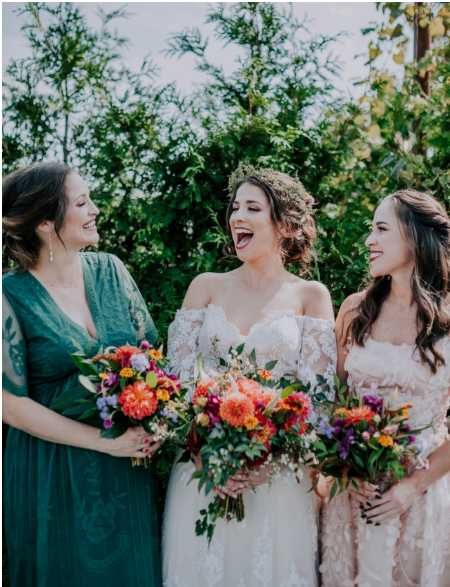
Wildflower Garden Bouquet

Medium bouquet featuring a mix of local, seasonal blooms such as zinnias, cosmos, celosia, and more. Colors fit to design.