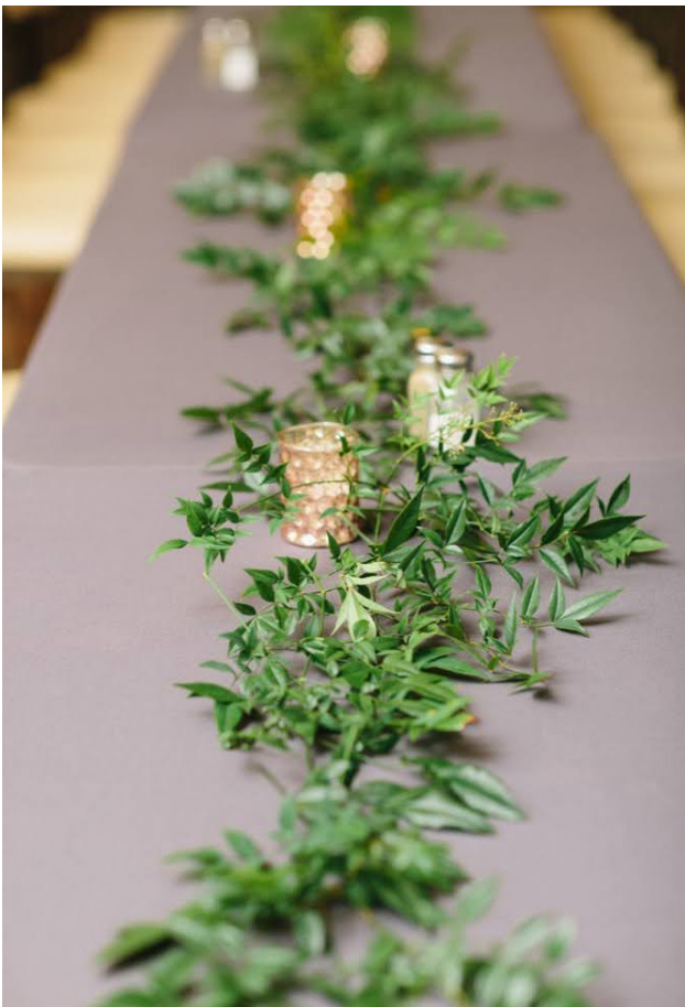
Long, Thin Swag

Full green swag to fit length of 6 ft. table.