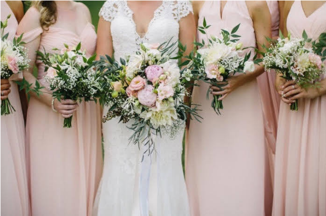
Lush Bridal Bouquet